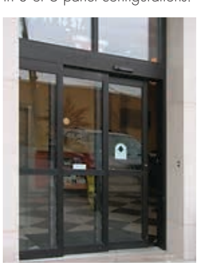
The 5100 series telescopic doors utilize 1 3/4" X 6 3/4" framing and are available in 3 or 6 panel configurations.

→ The Tandem sliding door system by record-usa allows both an identified entry door and an exit door work independent of each other while sharing the same header assembly for aesthetic and design simplicity. Another added feature is that these doors provide a larger clear door opening than the standard 5100 series would allow.