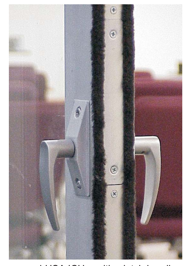
record-USA ICU positive latch handle