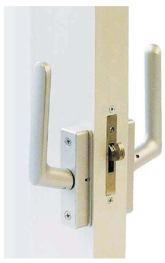
Typical ICU positive latch mechanism

The record positive latch has no protrusions below the bottom of the head section. The latch of the door occurs in the header. An access hatch is provided for maintenance as shown below.